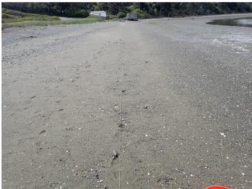
Cline Spit April 19, 2018