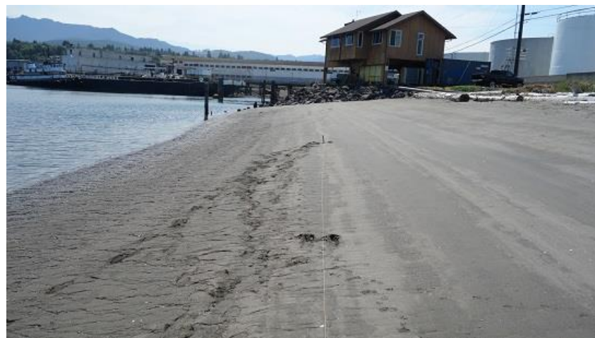
June 19, 2018 Ediz Hook Tesoro Beach