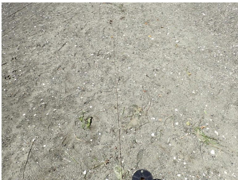
Pitship July 18, 2018