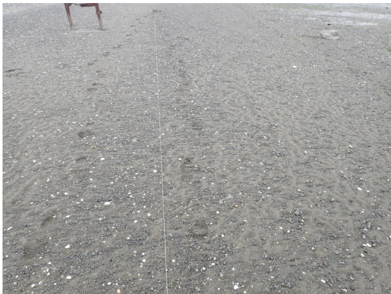
Cline Spit June 4, 2018