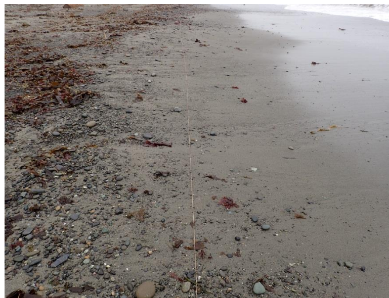
Dungeness Bluff July 18, 2018