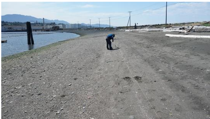
June 19, 2018 Ediz Hook West of Rowing Club