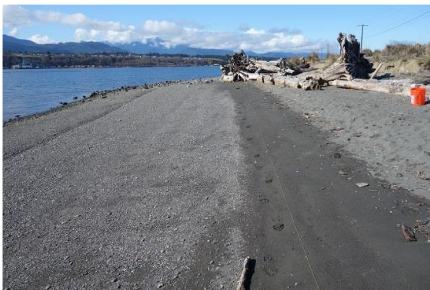
March 19, 2018 Ediz Hook A Frame