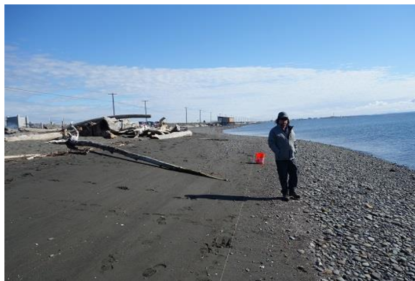
March 19, 2018 Ediz Hook West of Rowing Club