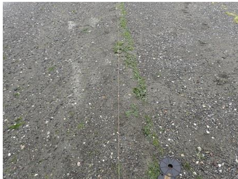
Cline Spit July 18, 2018