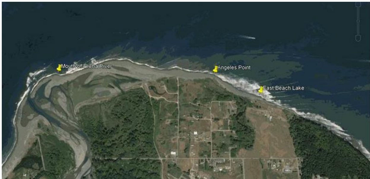
Figure 3. Locations of three restoration monitoring sites at Elwha Beach, Clallam County (Google Earth map).

The effort was expanded again in July 2017 to include monthly sampling at two sites on the beach east of the Elwha River mouth. Lower Elwha tribal members have seen forage fish along this beach and the sampling effort may document if they are spawning in this area (Figure 3). All three sites are active; however, most of the sampling has taken place at the river mouth and East Beach Lake.