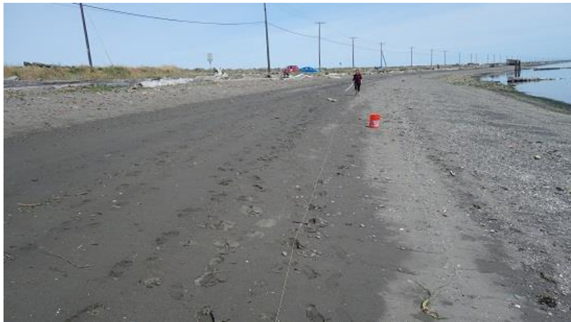
May 9, 2019 Restoration Site: Ediz Hook at Tesoro Beach