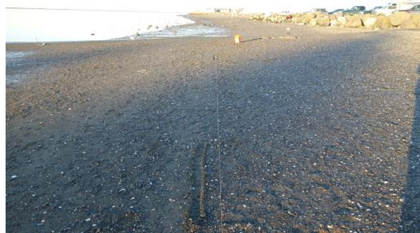
January 14, 2019 Index Site: Cline Spit (successful spawning sampling event)