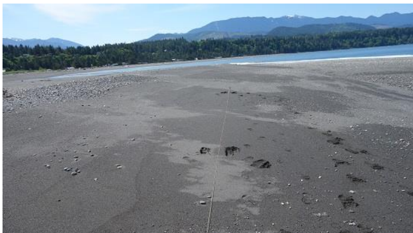
May 9, 2019 Restoration Site: Elwha River Mouth