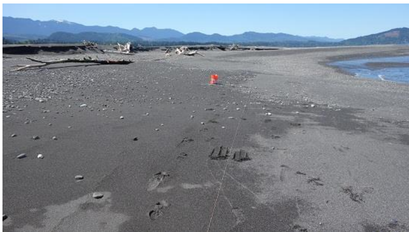
May 9, 2019 Restoration Site: East of Elwha River Mouth