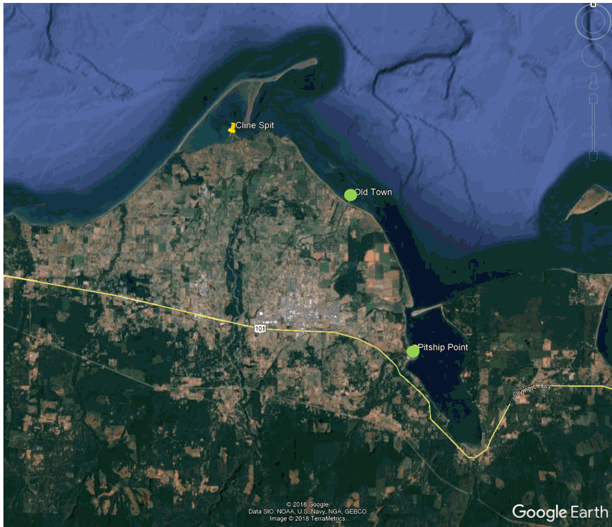
Figure 1. Locations of the current index site, Cline Spit, and the two old index sites, Old Town and Pitship. Yellow site is active and green sites are inactive.

In 2016 Clallam MRC joined the Northwest Straits Commission's forage fish monitoring efforts. Three Clallam MRC members and the project coordinator participated in a day long training provided by Washington Department of Fish and Wildlife (WDFW). Between October 2016 and March 2018 Clallam MRC conducted monthly surveys at two locations - Pitship Point adjacent to John Wayne Marina and at a public beach near Old Town east of Dungeness River. In April 2018 the sampling efforts were discontinued at these two sites and sampling was initiated at Cline Spit. The sampling effort at Cline Spit was continued throughout the fall of 2018 and the winter, spring and summer 2019. These three sites are considered index sites by WDFW (Figure 1).