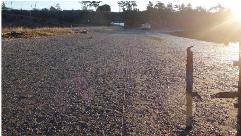
Figure 4. Photos taken on the sampling days at the index site and the four restoration sites.