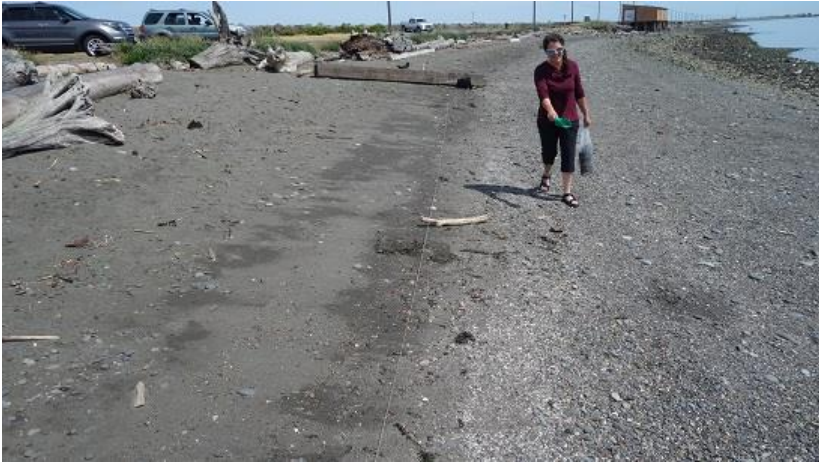
May 9, 2019 Restoration Site: Ediz Hook West of Rowing Club