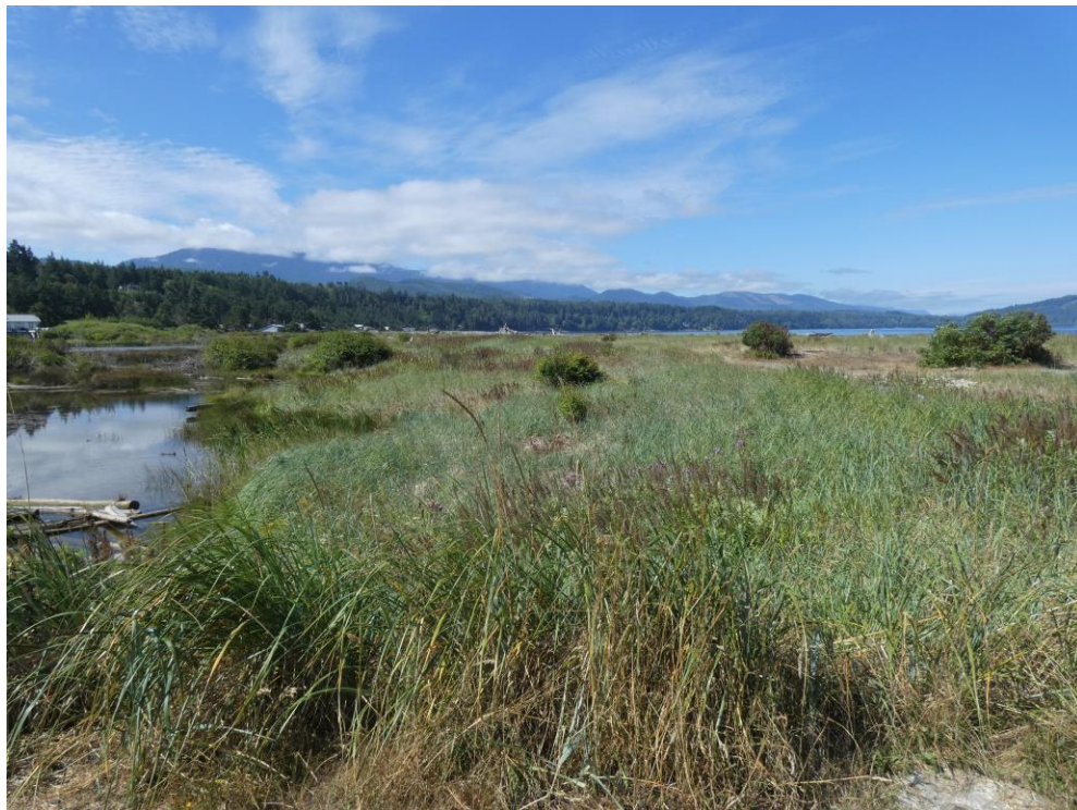
Figure 3. Dudley Pond and Elwha River estuary

The total number of people on the beach during the ½ hour surveys ranged from 6 to 54, the highest numbers were observed on good surf days. An average of 2 people per car was calculated based on the 12 surveys. People were mostly walking the beach, but on surf days activities included surfing (22-38% of all observed people), walking (12-72%) and sitting (0-34%). During three surveys people, mostly kids, were observed playing (4-36%) and one couple was bird watching (25% of all people observed that day). Other possible beach activities such as kayaking, fishing, swimming or kite flying were not observed during the 12 surveys. Figures 3 and 4 show the river mouth, beach and people activities.