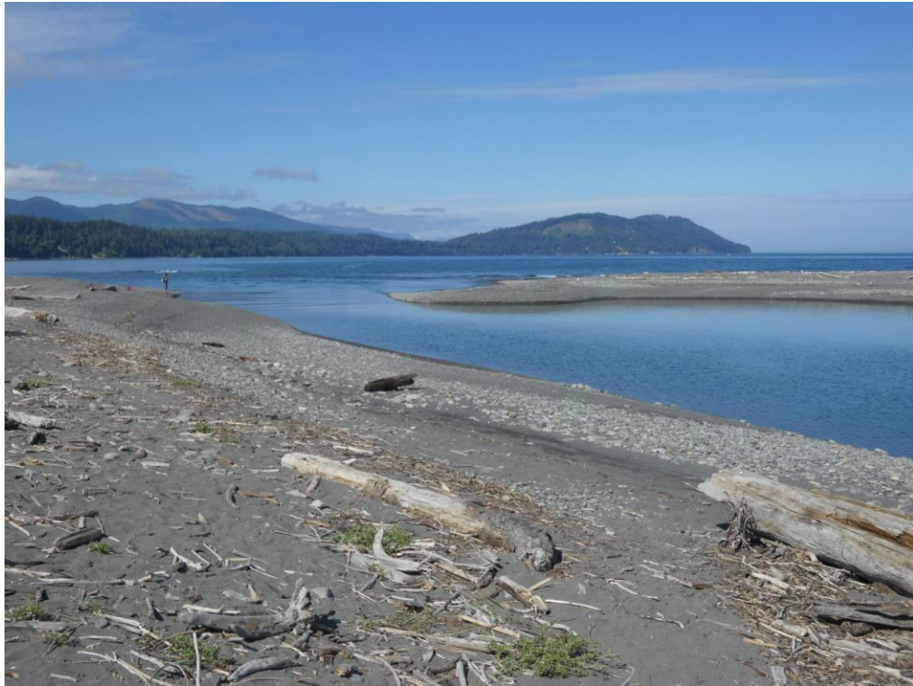
Figure 4. Elwha River mouth and beach