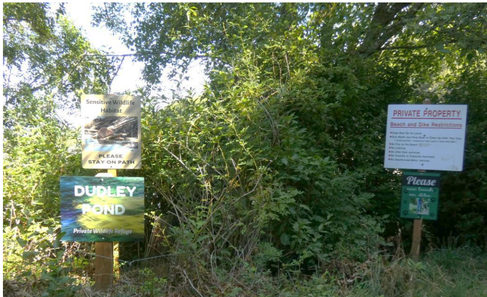
Figure 6. Signage at the trailhead encouraging visitors to respect the sensitive wildlife habitat.

During the one year approximately 3,800 bags were distributed and assumed used by dog owners. Replacing the dog waste bags was part of the responsibilities of an internship and MRC Coordinator until an MRC member stepped up to champion the project.