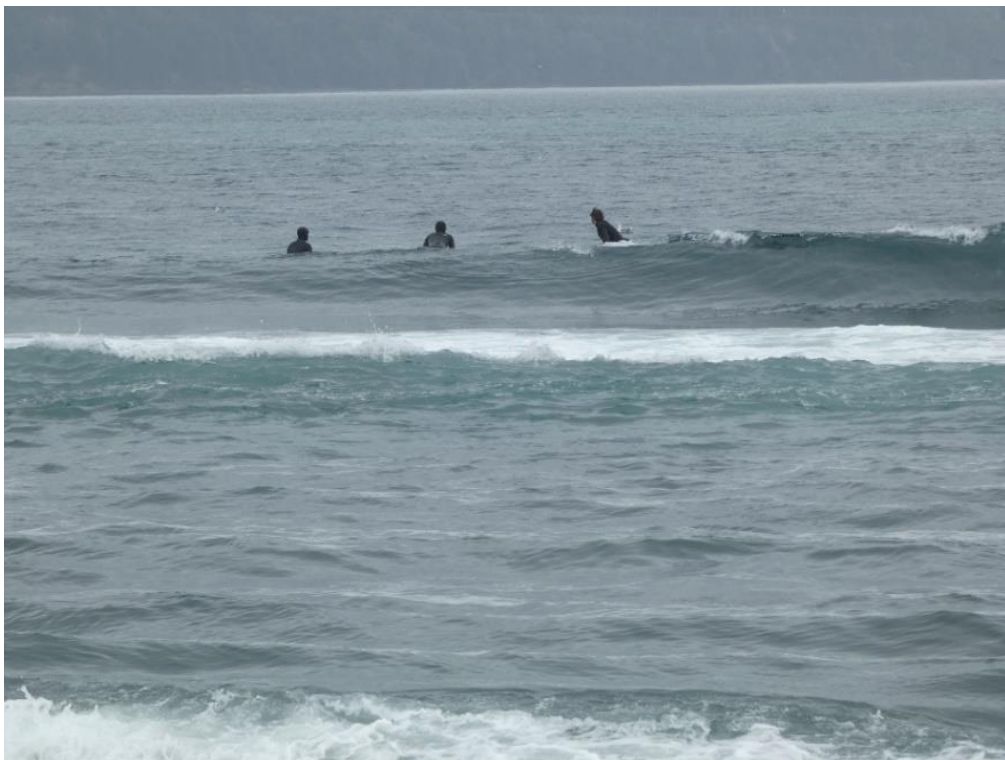
Figure 5. Surfers at the beach