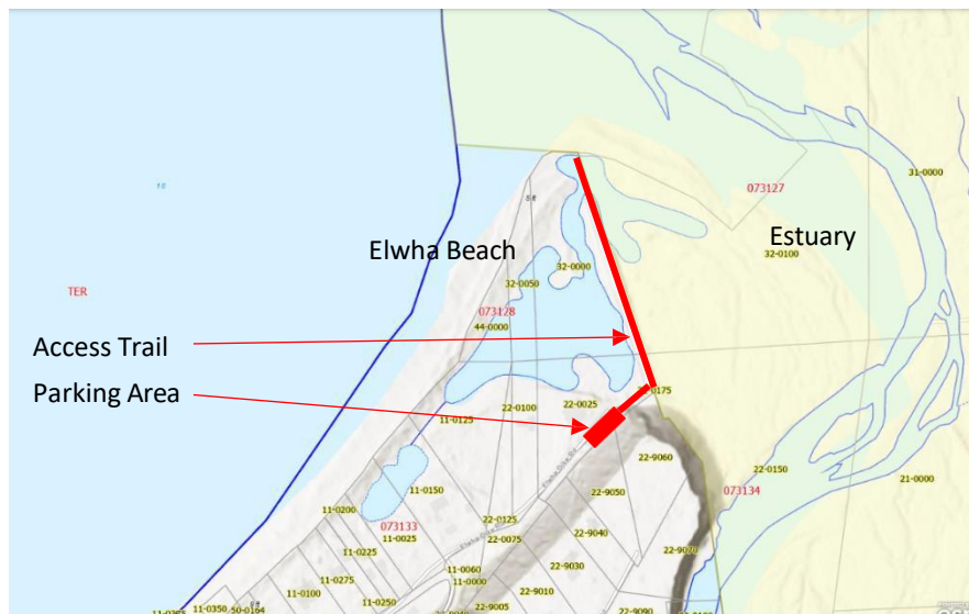
Figure 2. Public access to Elwha Beach and landownership. Lower Elwha Klallam Tribe owns the land shaded yellow. Private ownerships are depicted by the individual lots.