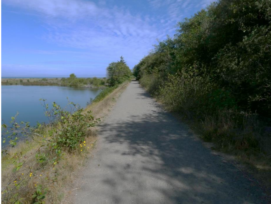
Figure 1. Access trail on top of the dike with the river and estuary on the right (tribal owned) and Dudley Pond on the left (private owned).