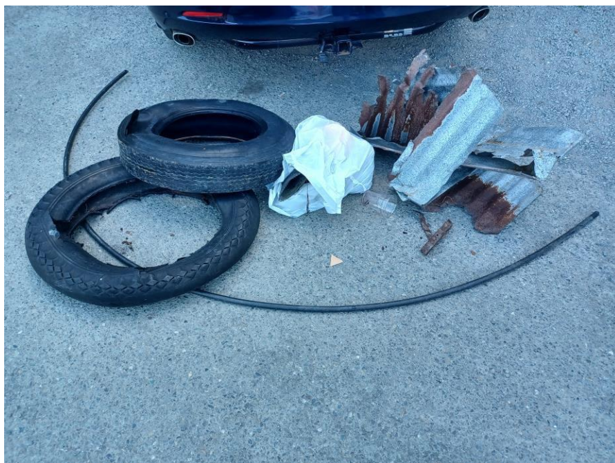
Figure 9. Tires, metal and plastic debris removed from the beach and taken to Port Angeles transfer station.

Organized marine debris removal no longer occurs at the beach; however, over time people have taken debris off the beach and placed it next to the Sanikan. In the summer of 2023, the marine debris was taken to the Port Angeles transfer station for disposal (Figure 9).